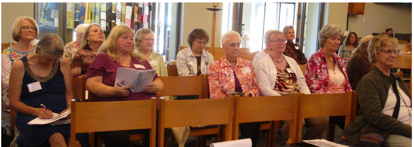
Women of Mid-Missouri Gathered at St. Andrews, Columbia, with a theme from 1 Thessalonians “Rejoice always, pray without ceasing, give thanks in all circumstances, for this is the will of God in Christ Jesus for you.” (5: 16-18 NRSV)