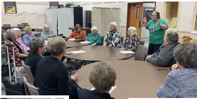
Women of Central Kansas cluster gathered at Bethany Lutheran Church for conversation and Bible Study