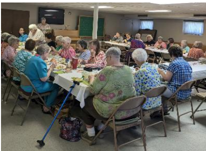
Left: Women of Western Kansas Cluster gather in Hays, Kansas