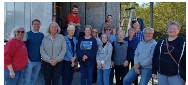
Ingatherings Bring Together Smiling Faces and Willing Hearts