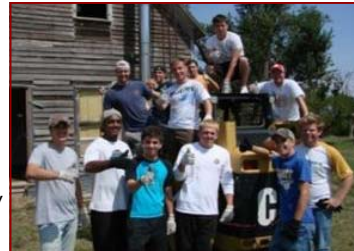
Students from Bethany College assist with disaster relief in Greensburg, Kan.