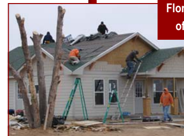
Volunteers Greensburg, Kan.