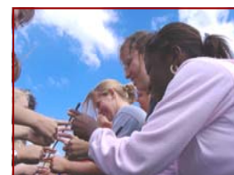
Lutheran Campus Ministry Retreat at Camp Tomah Shinga