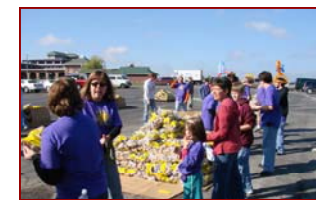
Members of Atonement, Florissant, Mo. at the Festival of Sharing in Sedalia, Mo.