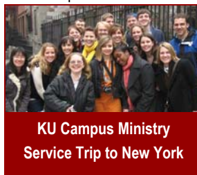
KU Campus Ministry Service Trip to New York